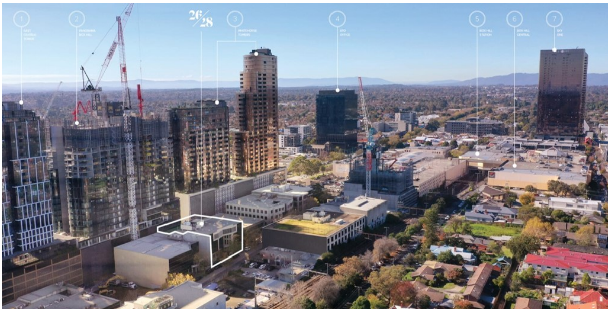
The office (outlined) was offered permit-ready for a 30-level mixed-use building.

In May Charter Hall outlaid $230m for the suburb's first skyscraper – a 20 floor office leased to the ATO – at 913 Whitehorse Rd.